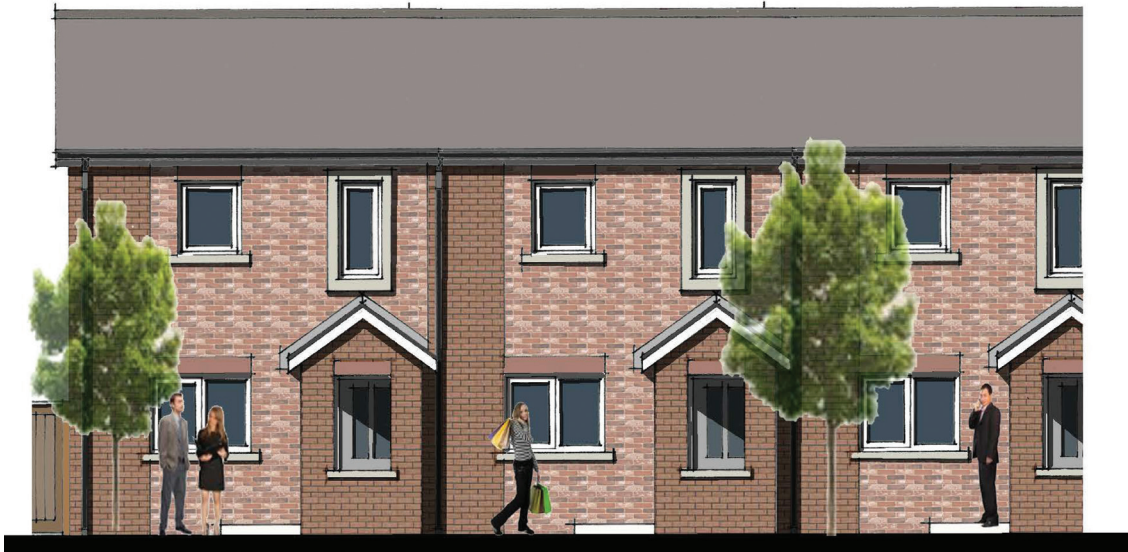
Typical house frontage - 1 bedroom